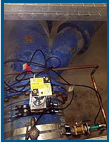
Figure 4: FPI-X FM Installed At NE J Avenue Booster Station

Cedar Rapids' new FPI-X Mag dual sensor assembly units have been operational for over 24 months at both of the city's booster station sites. One FPI-X Mag meter was installed on the single 30-inch line at the SW Bowling Booster Station to measure accurately the flow from its three centrifugal pumps (Fig 3). Two FPI-X Mag meters were needed at the NE J Avenue Booster Station, each measuring the total output of four vertical turbine pumps on two 24-inch lines (Fig 4).