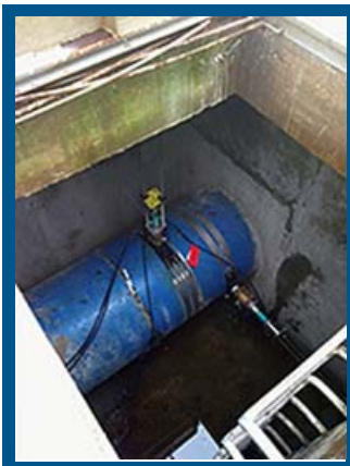
Figure 3: FPI-X FM Installed At SW Bowling Booster Station

The FPI-X product configuration is the newest line extension of the successful FPI Mag® product line from McCrometer. As Greg Webster, Sr. Applications Specialist at McCrometer describes, "Our traditional FPI Mag has been on the market for about 3 years now and is seeing wide acceptance in municipal and industrial markets. For the bulk of the applications we see, our FPI Mag is the perfect fit. However, there are specific applications where the FPI-X configuration is best. McCrometer developed the FPI-X to accurately measure flow from multiple pumps in series and can measure flow where almost no other technology can."