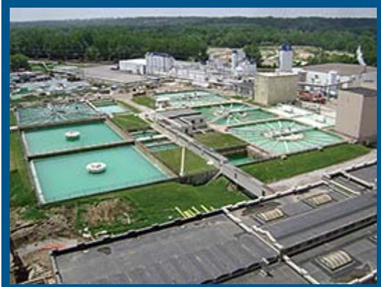
Figure 1: City of Cedar Rapids Water Treatment System

By Nicholas Voss Product Manager, McCrometer